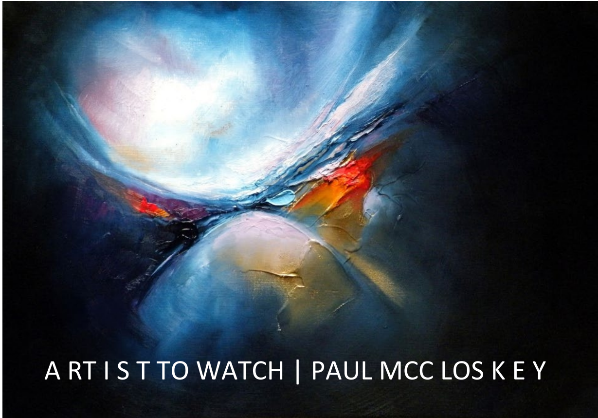
Awakening Reloaded in Violet. 42cm X 30cm