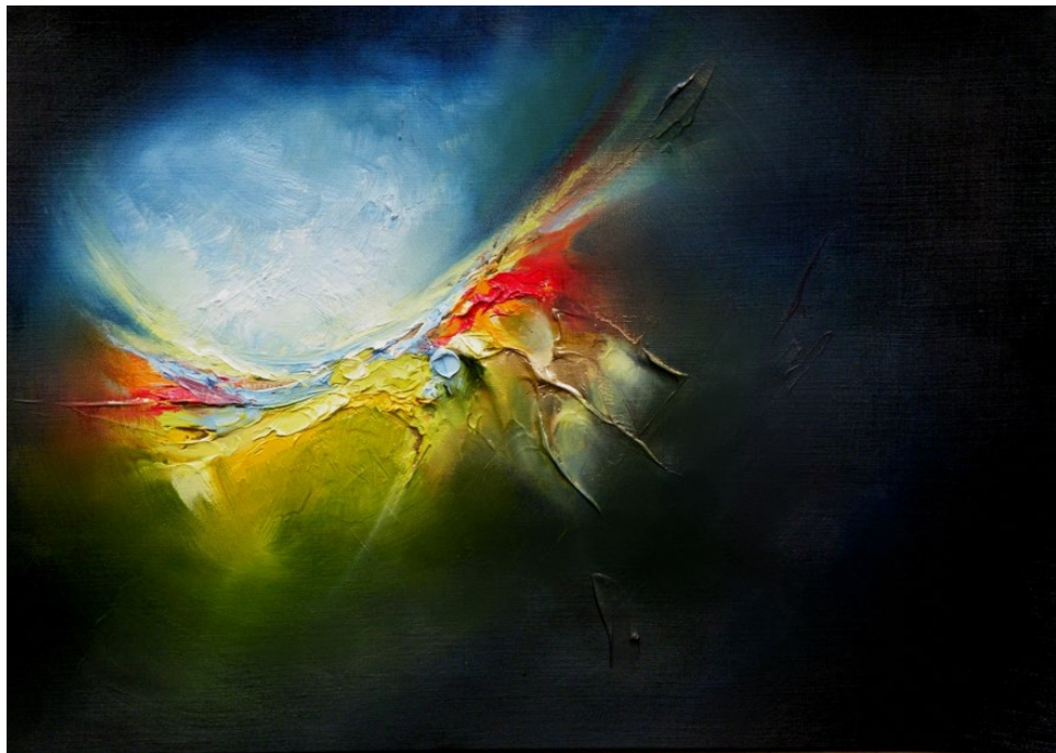
Awakening Reloaded in Blue-green2. 42cm X 30cm