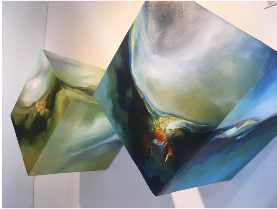
Installation view of The Omega 3D. 2018.

AT: Your newest work, the Omega Series, combines your abstract painting style with that of 3D rotating cubes, allowing the viewer to experience the paintings from an entirely different perception. What inspired this shift towards 3D?