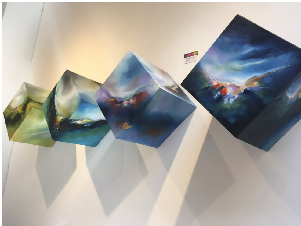
Installation view of The Omega 3D. 2018.

PM: I prefer to abstract the subject rather than meticulously represent what is in front of me, my work is mainly based on landscape, this is the starting point based on a accumulation of memories, interpretation and surrounding views. Landscape gives the viewer an initial starting point a familiar focus which invites them in, once in then the work is open to the viewers interpretation based on their own memories, emotions and mood. Abstraction allows for this emotional interaction both for me the artist and the viewer. However process is primary for me, the act of doing of allowing is where the magic happens irrespective of the subject.